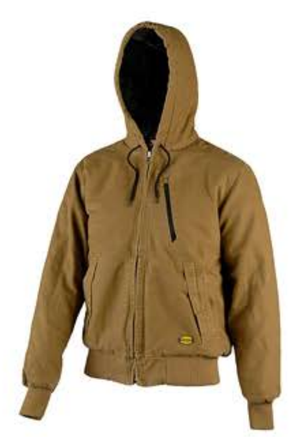
30141 - TOBACCO BROWN