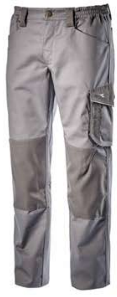
75070 - STEEL GREY