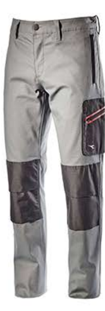
75047 - RAIN GREY