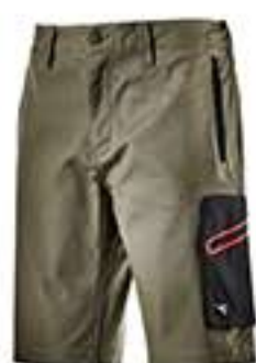
70167 - GREEN FOREST NIGHT