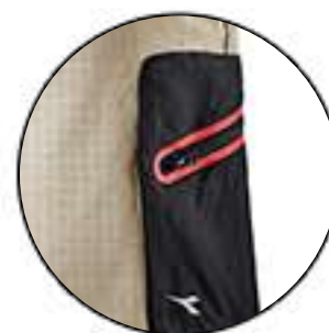
SIDE ZIPPED POCKET