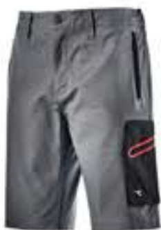
75047 - RAIN GREY