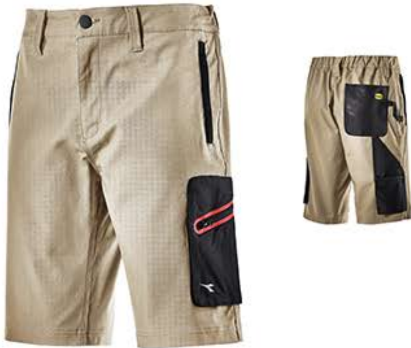
25070 - NATURAL BEIGE