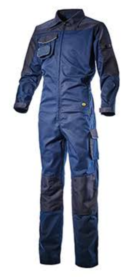
60062 - CLASSIC BLUE