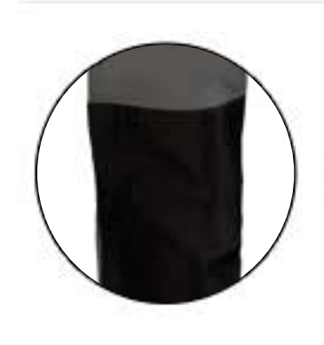
KNEE PADS POCKET