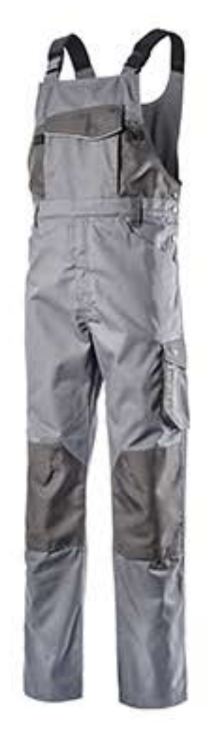
75070 - STEEL GRAY