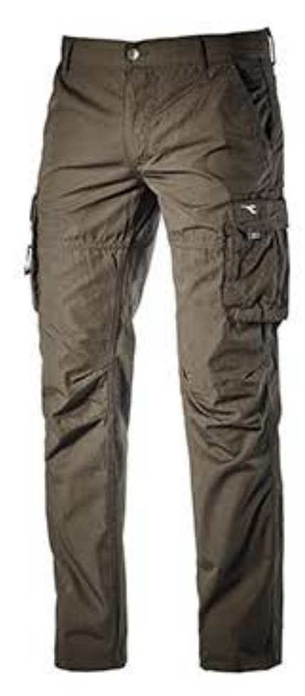
80006 - BLACK FIR GREEN