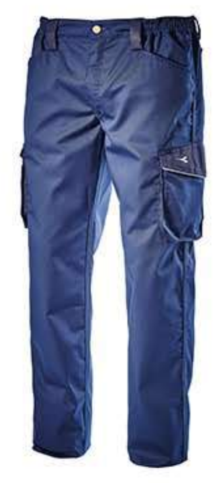
60062 - CLASSIC BLUE